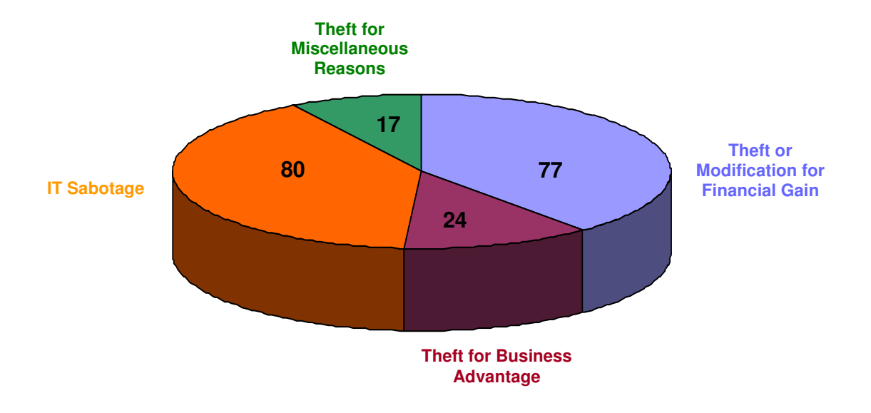
Figure 1. Breakdown of Insider Threat Cases<sup>5</sup>

Some cases fell into multiple categories. For example, some insiders committed acts of IT sabotage against their employers' systems, then attempted to extort money from them, offering to assist them in recovery efforts only in exchange for a sum of money. A case like that is categorized as both IT sabotage and theft or modification of information for financial gain. Four of the 190 cases were classified as theft for financial gain and IT sabotage. Another case involved a former vice president of sales copying a customer database and sales brochures from the organization before deleting them and taking another job. This case is classified as theft of information for business advantage and IT sabotage. One case was classified as theft for business advantage and IT sabotage. Finally, three cases where classified as IT Sabotage and Theft for Miscellaneous Reasons.