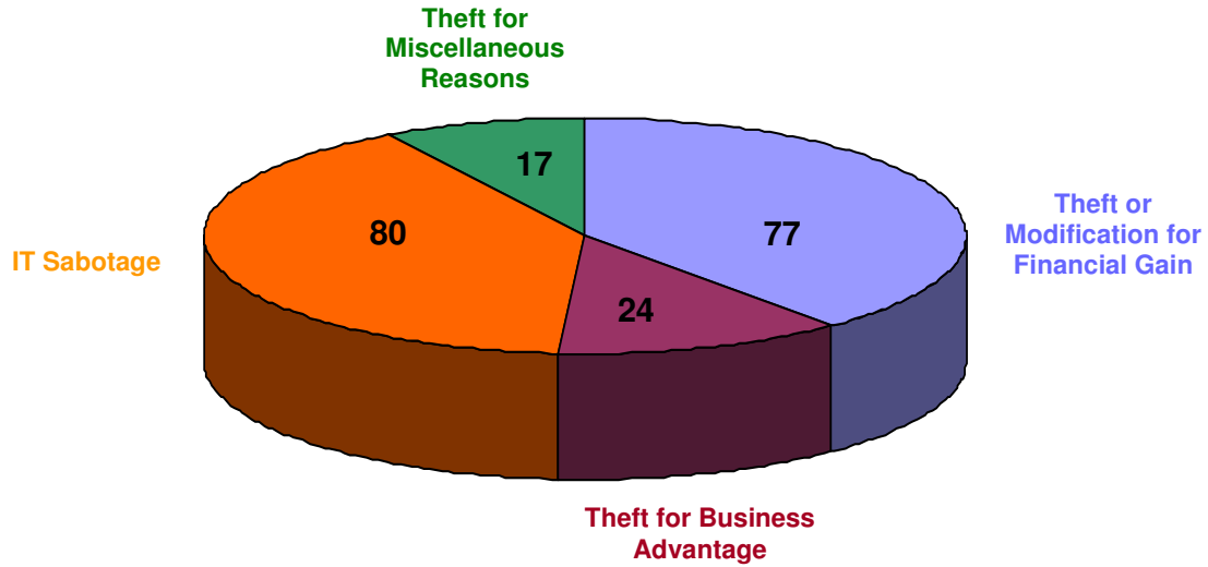
Figure 1. Breakdown of Insider Threat Cases 5

Some cases fell into multiple categories. For example, some insiders committed acts of IT sabotage against their employers’ systems, then attempted to extort money from them, offering to assist them in recovery efforts only in exchange for a sum of money. A case like that is categorized as both IT sabotage and theft or modification of information for financial gain. Four of the 190 cases were classified as theft for financial gain and IT sabotage. Another case involved a former vice president of sales copying a customer database and sales brochures from the organization before deleting them and taking another job. This case is classified as theft of information for business advantage and IT sabotage. One case was classified as theft for business advantage and IT sabotage. Finally, three cases were classified as IT Sabotage and Theft for Miscellaneous Reasons.